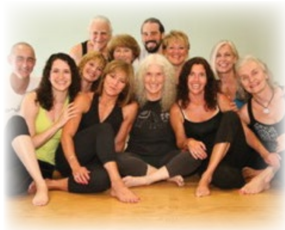
Maha Yoga Center, Bridgewater, MA