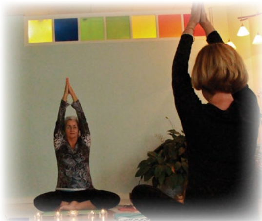
Opening Lotus Studio, Holden, MA